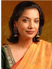
Shabana Azmi Actress & Social Activist

Shabana Azmi is one of the leading actresses of Indian cinema . She is a film actress as well as a social activist, and her performances in films in a variety of genres have earned her acclaim and awards including five wins of National Film Award for Best Actress. Her first release was Shyam Benegal’s “Ankur” (1972), which won the national award. She also acted in experimental and parallel Indian cinema. Deepa Mehta’s 1996 film “Fire”, which was an on-screen depiction of lesbianism drew severe protests and threats from many social groups as well as by the Indian authorities. Her role as Radha brought her international recognition with the Silver Hugo Award for Best Actress at the 32nd Chicago Film Festival and Jury Award for Best Actress at Outfest, Los Angeles.