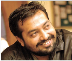
Anurag Kashyap Film Director & Screenwriter

Anurag Kashyap (born 10 September 1972) is a critically acclaimed Indian film director and screenwriter. As a director, he is known for “Black Friday” (2004), a controversial and award-winning Hindi film about the 1993 Bombay bombings, followed by “No Smoking” (2007), “Dev D” (2009) and “Gulaal” (2009). As a screenwriter, he wrote the scripts for the Filmfare Award winning “Satya” (1998) and the Academy Award nominated Canadian film “Water” (2005). He is considered one of the most versatile and prolific filmmakers in contemporary Hindi cinema. “Satya” was a commercial and critical success and Kashyap collaborated with Ram Gopal Varma on a few more films writing the screenplay and dialogues for “Kaun?” (1999) and the dialogues for “Shool” (1999). He also wrote the dialogues for Mani Ratnam’s “Yuva” (2004). Kashyap made his directorial debut with “Paanch”, with Kay Kay Menon as the lead in 2000. In 2007, he adapted Stephen King’s 1978 short story Quitters, Inc. as “No Smoking”, which was received well by critics.