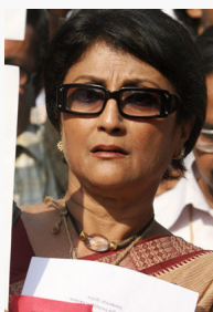
Aparna Sen Filmmaker, Actress & Social Activist

Shabana Azmi was graced with the Padma Shri Award in 1988, followed by the Rajiv Gandhi Award for Excellence in Secularism in 2004 and the Gandhi International Peace Award in 2006. Since 1989, she has been a member of the National Integration Council headed by the Prime Minister of India; a member of National AIDS Commission (of India); and was nominated (in 1997) as a member of the Rajya Sabha, the upper house of the Indian parliament. The United Nations Population Fund appointed her as its goodwill Ambassador for India, and the University of Michigan conferred (in 2002) on her the Martin Luther King Professorship award in recognition of her contribution to arts, culture and society.